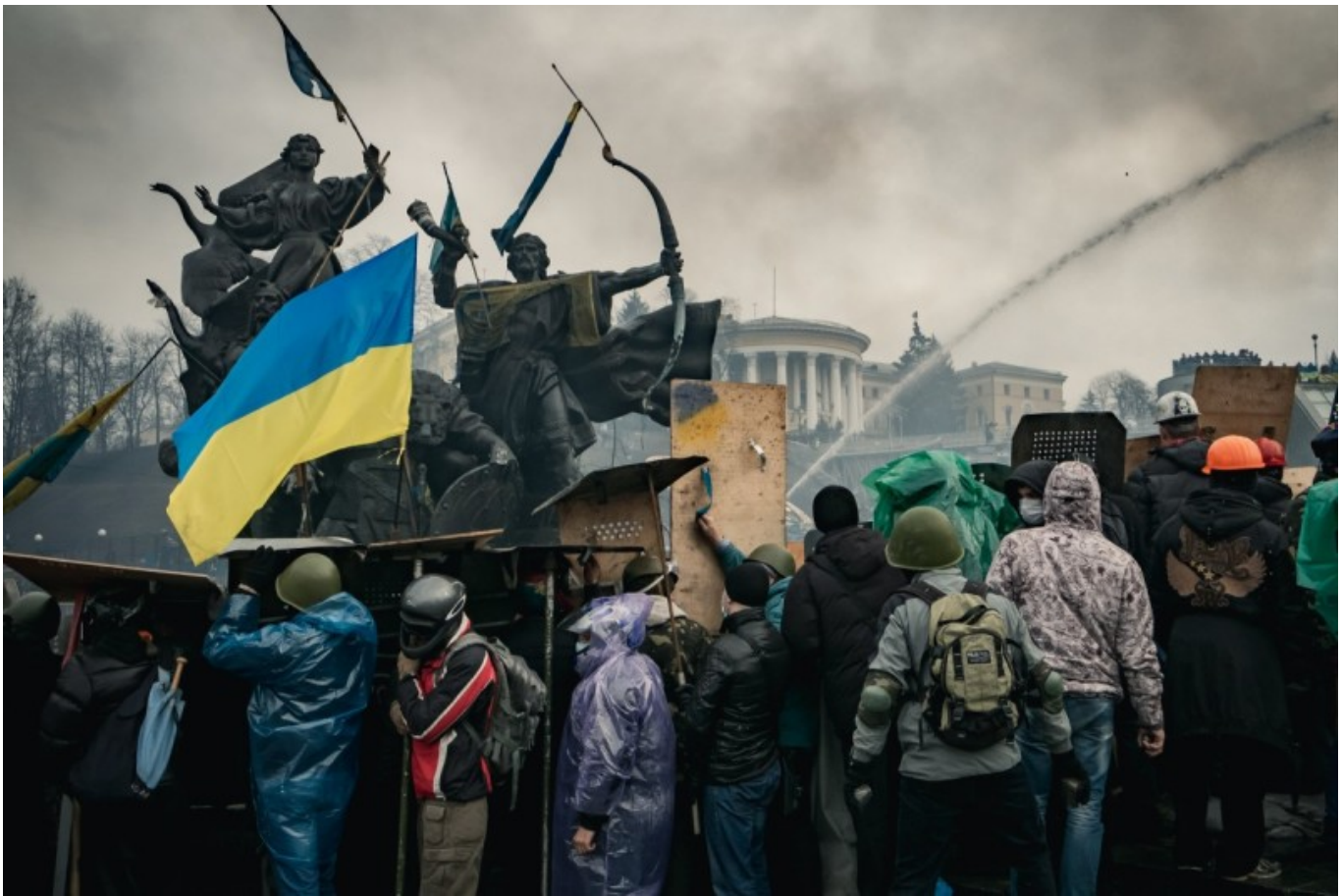
Thousands of protesters fill Independence Square in Kyiv, Ukraine during the Maidan Revolution, February 19, 2014.

A nearly one-million-word verdict from Ukraine's Maidan massacre trial has recently confirmed that many Maidan activists were shot not by members of Ukraine's Berkut special police force or other law enforcement personnel but by snipers in the far-right-controlled Hotel Ukraina and other Maidan-controlled locations a decade ago today. The verdict, handed down on October 18, 2023, states specifically that this hotel was controlled by Maidan activists and that an armed, far-right-linked Maidan group was in the hotel and fired from it. It also confirms that there was no Russian involvement in the massacre and that no massacre orders were issued by then President Viktor Yanukovich or his ministers. The verdict concludes that the Euromaidan was at the time of this massacre not a peaceful protest but a "rebellion" that involved the killing of Berkut and other police personnel.