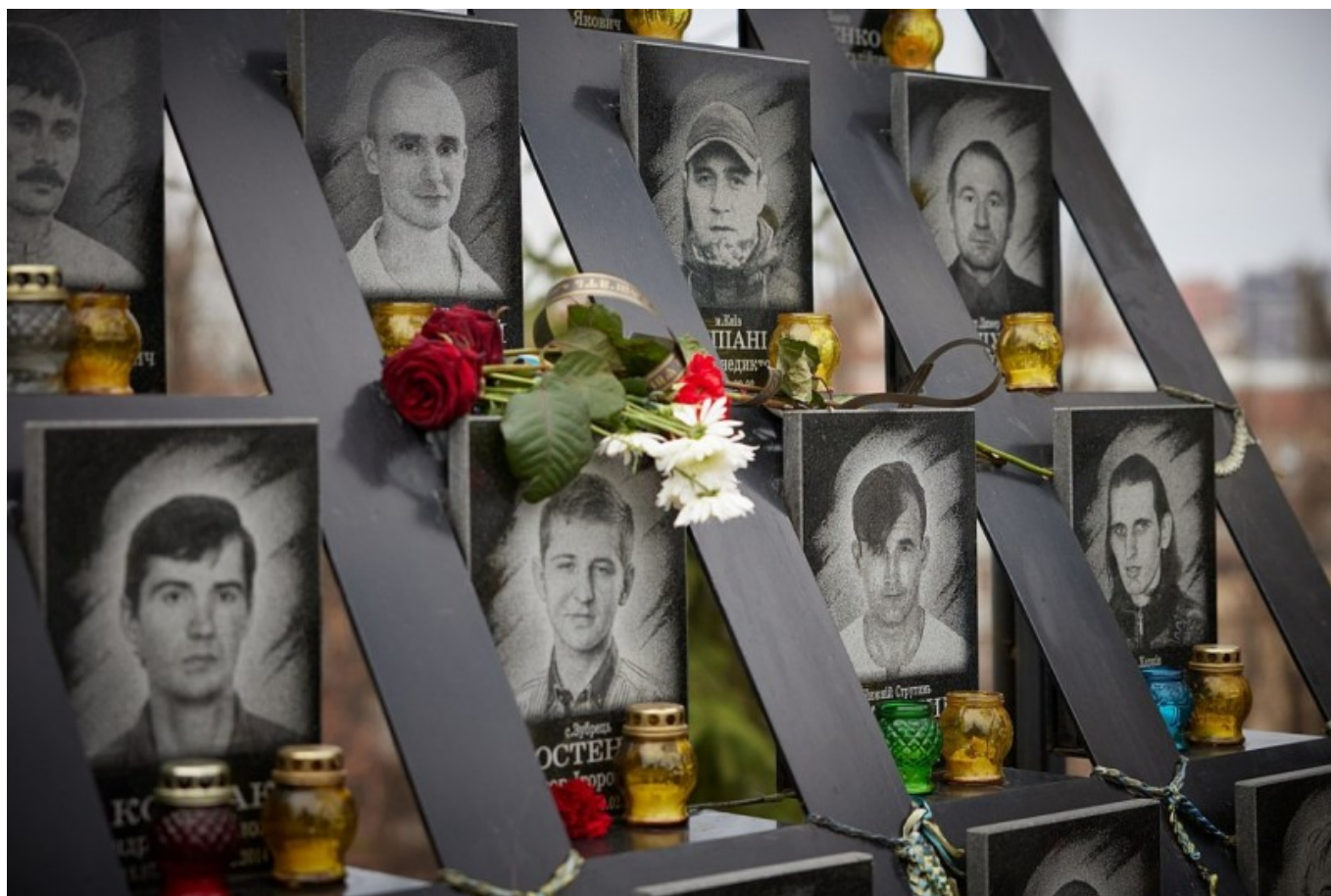
Memorial to protesters killed in the Maidan massacre in Kyiv.

The verdict also confirms that the first three activists killed were shot with pellets of a type used for hunting, at a time before the Berkut unit, whose five members were falsely charged with the killings, had even been deployed. It explicitly states that at least one of these activists was shot from the Maidan-controlled area by one of the Maidan shooters using a hunting rifle.